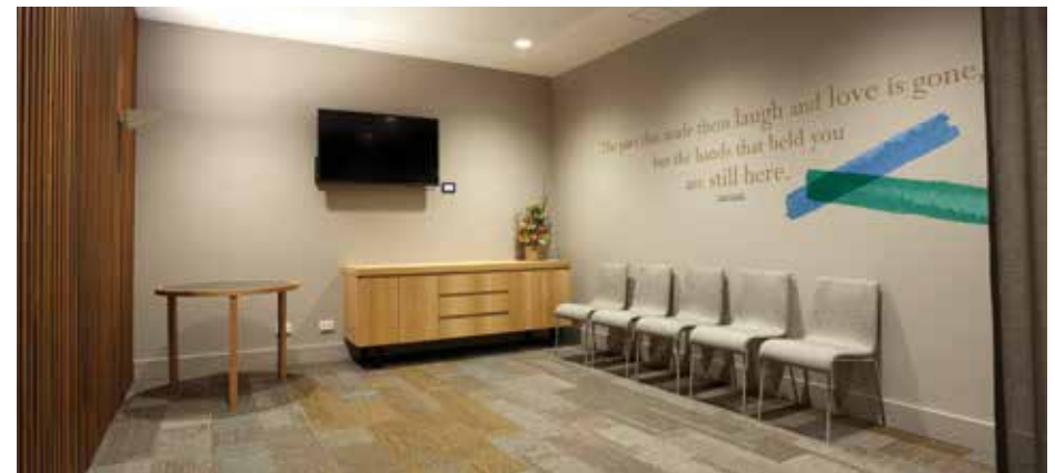
Bunurong Memorial Park Viewing Rooms

A funeral viewing is an intimate gathering, usually conducted prior to the funeral (the day before or on the day of). It provides family and friends with a final viewing of the deceased in a private and personal setting.