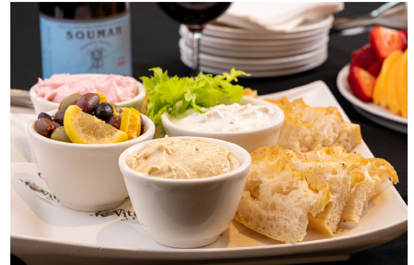
Platter of dips (3 varieties)