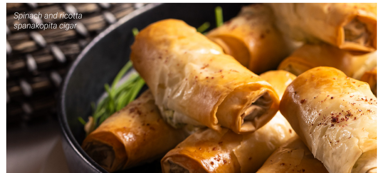
Spinach and ricotta spanakopita cigar