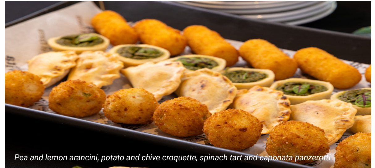
Pea and lemon arancini, potato and chive croquette, spinach tart and caponata panzerotti