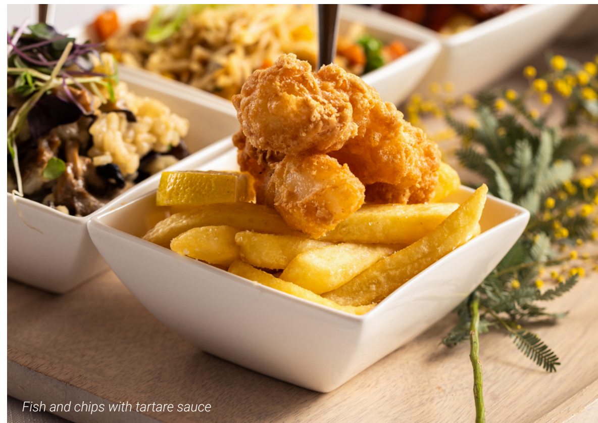
Fish and chips with tartare sauce