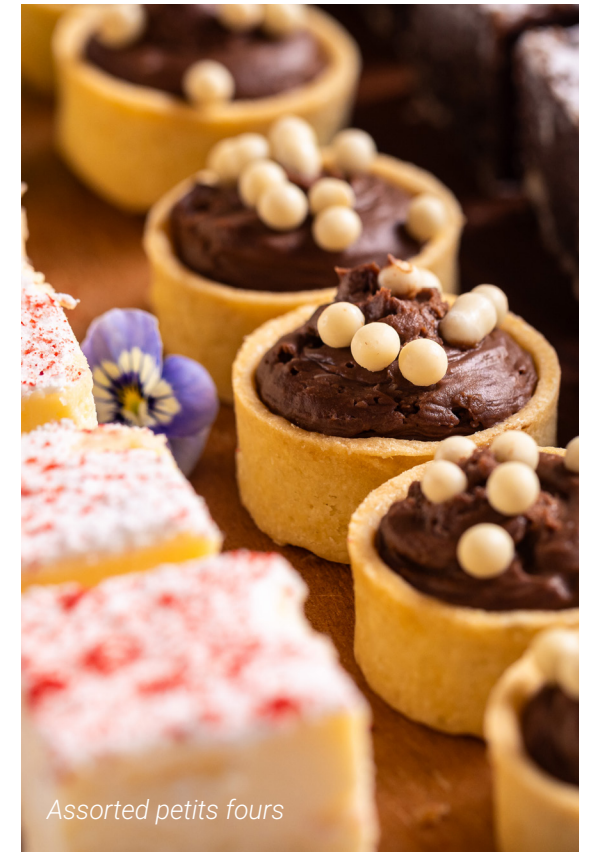
Assorted petits fours