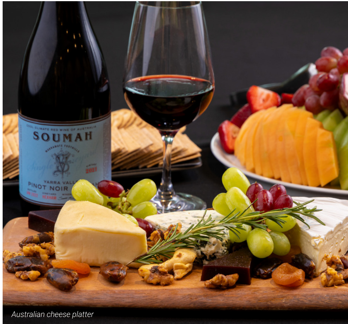
Australian cheese platter

* Platters only available in addition to your per person menu selection.