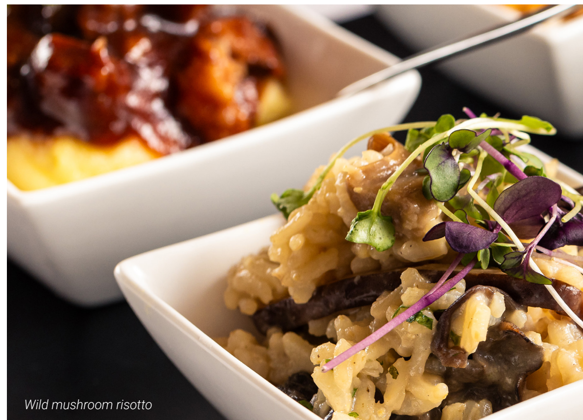
Wild mushroom risotto