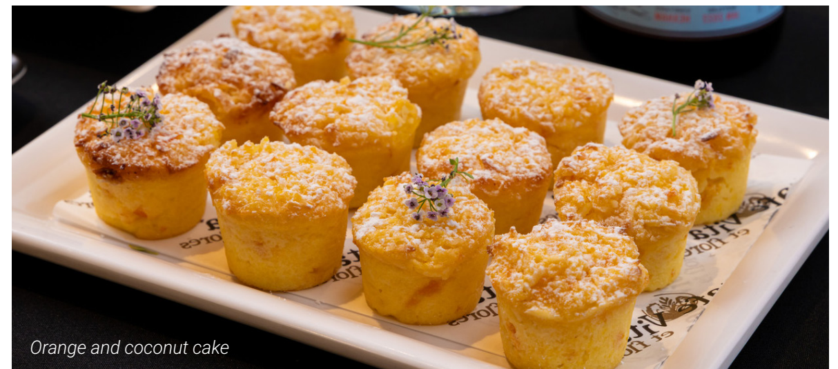
Orange and coconut cake