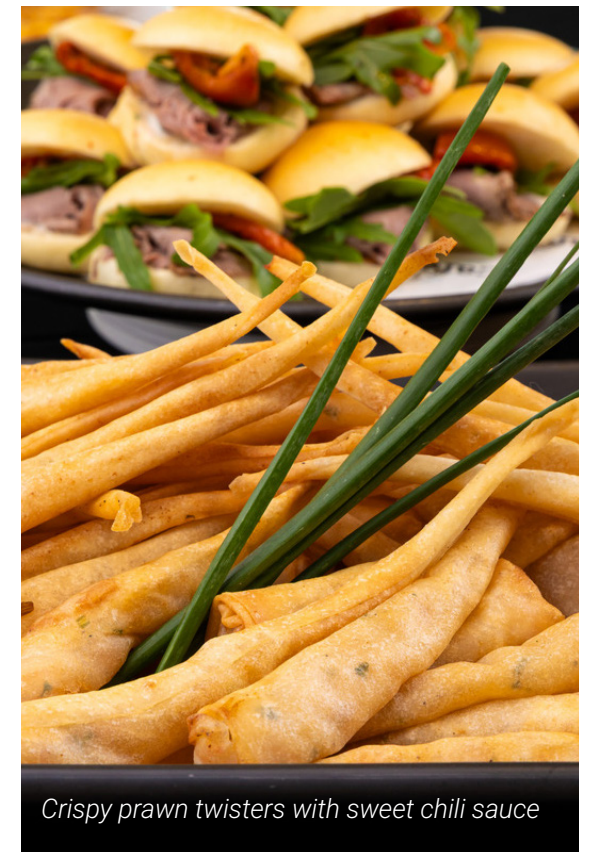
Crispy prawn twisters with sweet chili sauce