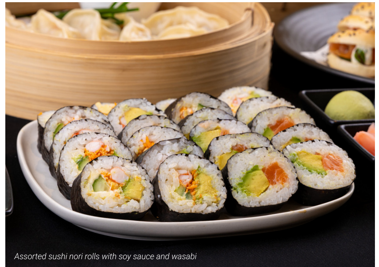
Assorted sushi nori rolls with soy sauce and wasabi