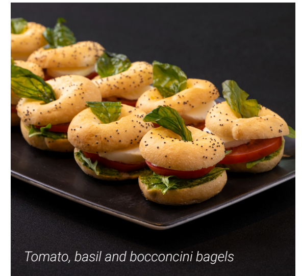
Tomato, basil and bocconcini bagels