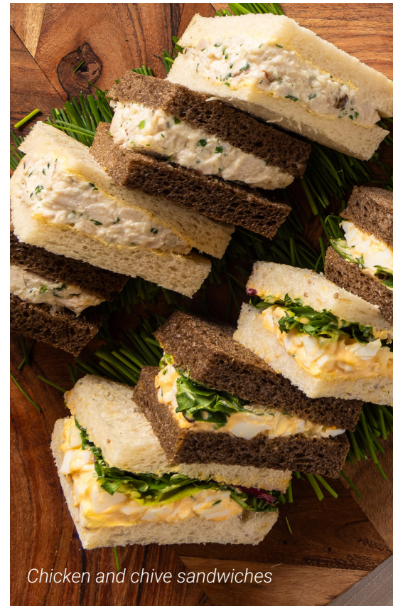
Chicken and chive sandwiches