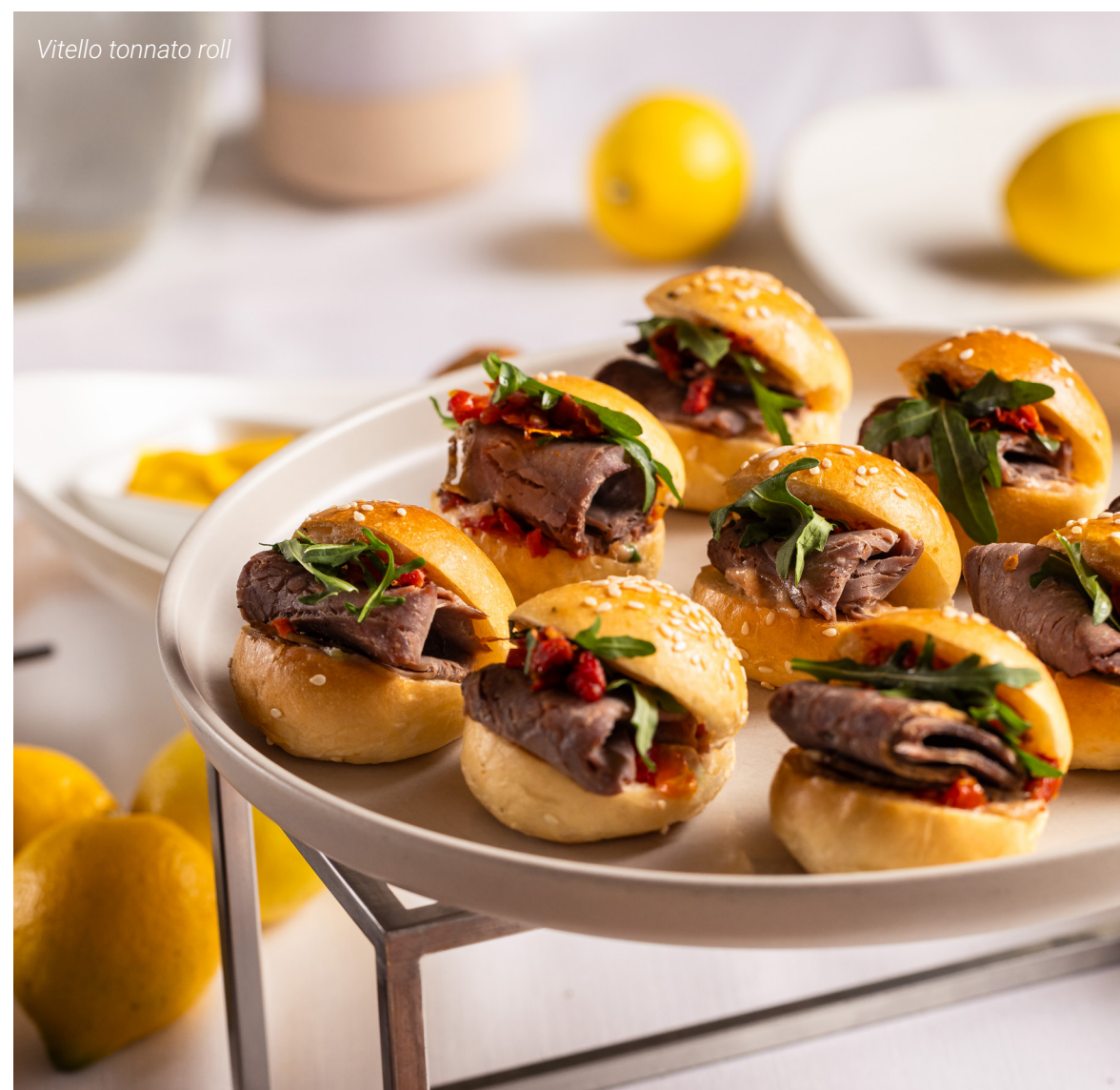
Vitello tonnato roll