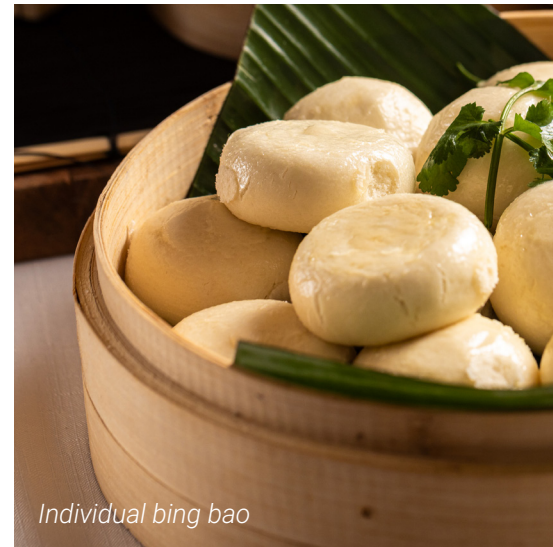
Individual bing bao