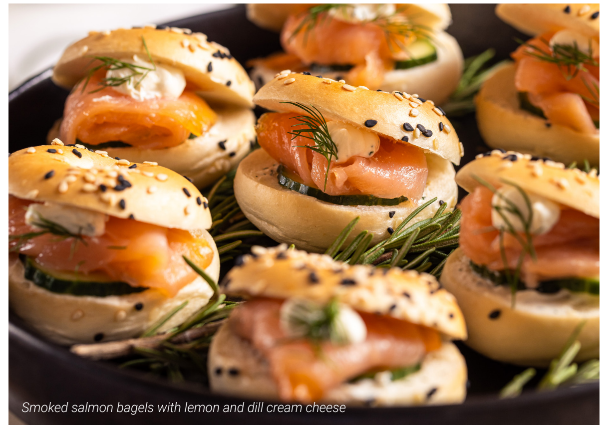
Smoked salmon bagels with lemon and dill cream cheese