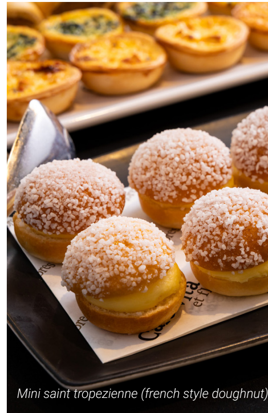
Mini saint tropezienne (french style doughnut)